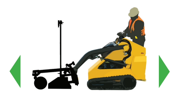
Grades in both directions to help optimize productivity